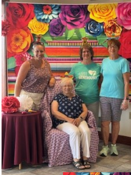
Cinco de Mayo Baked Potato Bar May 5, 2025 Lots of fun!