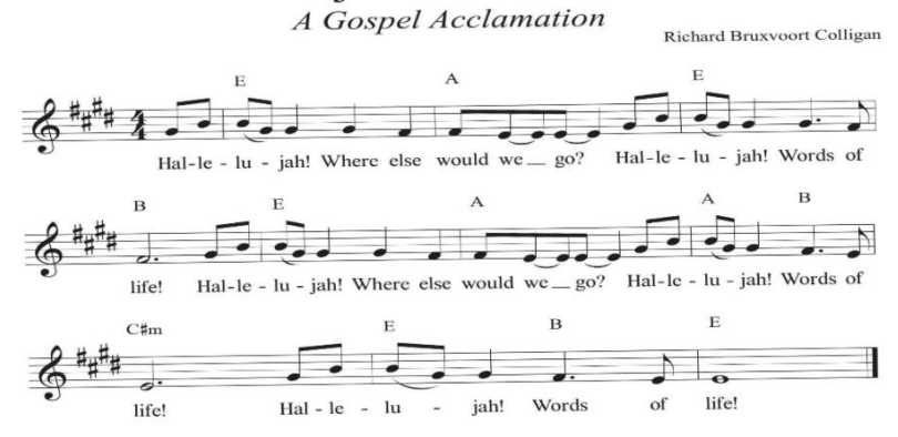
© 2019 Worldmaking.net (ASCAP). All rights reserved. Use only with permission please. Licensed via OneLicense.net, CCLI and Worldmaking.net.

*The Holy Gospel according to Luke, the sixth chapter. Glory to you, O Lord.