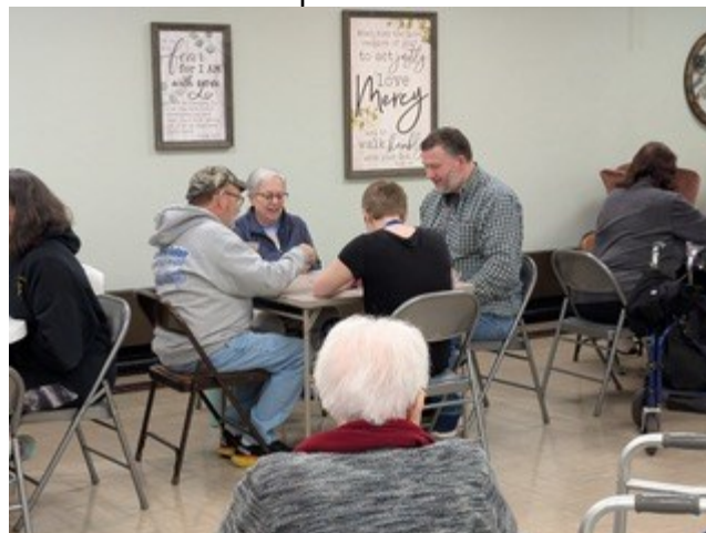
Game Night at ELC on January 18