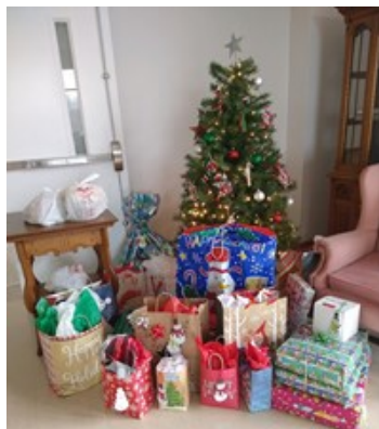
Adopt A Family Gifts 2021

Send us your God moments and we will share them each week!