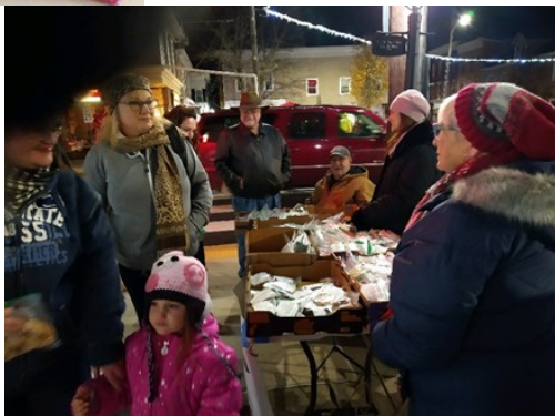
Heritage Christmas Stand 2021