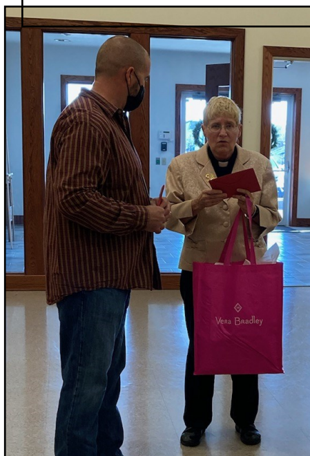
Farewell Lunch Sunday, December 26, 2021