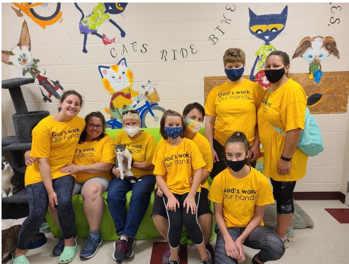
The Confirmation Class volunteered at the Antietam Humane Society on September 11