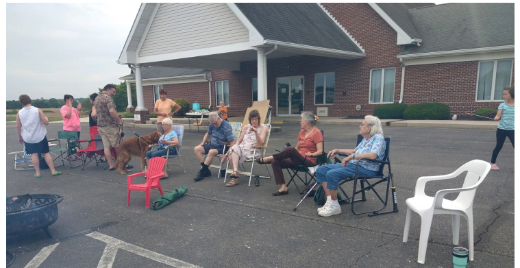
S'more Party May 22, 2021

External: Renew and deepen our connection with our neighbors in the community and continue working with the Food Pantry