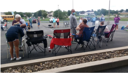
S'more Party 2020

Saturday, May 22, at 6PM, council invites you to a S'more Party outside in the parking lot. Council will provide the fire and fixings for s'mores. Bring your own lawn chairs and beverages, if desired. We will sit in safe groups, socially distanced, and get to see one another, have conversation and simply enjoy being the body of Christ. We are learning how to BE the church not simply GO to church.