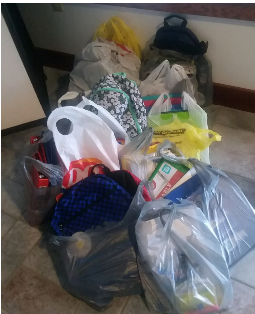
Some of the school supplies donated by Trinity members

This year we won't be able to do our traditional backpack blessing during worship. So, we're having a Backpack Blessing during the S'more's Party. Bring your school backpacks. Adults, bring your briefcases. We'll bless the backpacks and briefcases asking God's blessing on you and the work you're called to do in God's world.