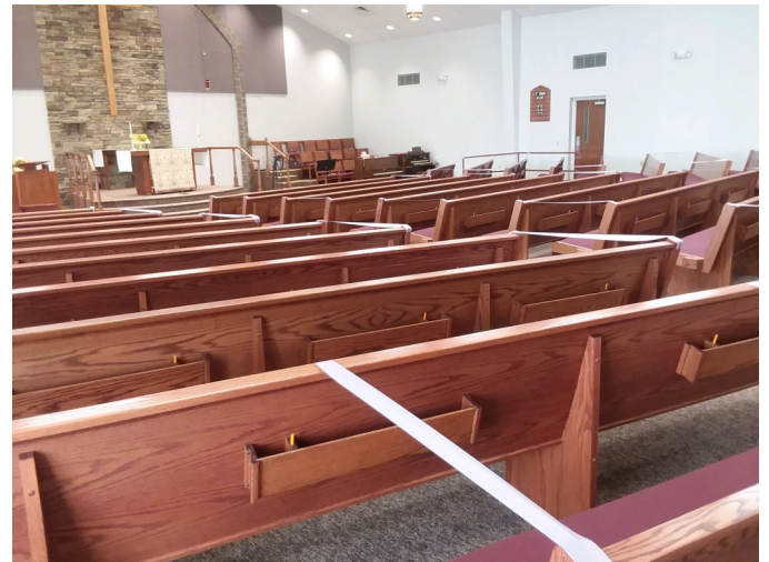
Sanctuary is ready for September 20

those who feel safer worshipping from home. Please like and share each worship service so we can have the widest exposure. This is one way Trinity Lutheran can "Share Christ in Word and Deed."