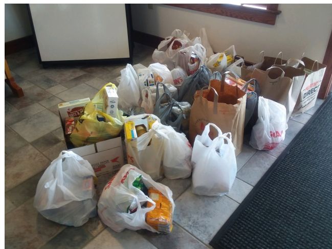
Some of the food delivered to food pantry