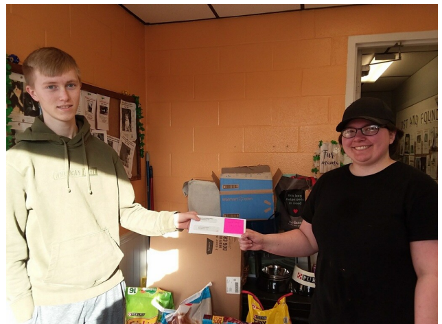
Presenting Check to Humane Society