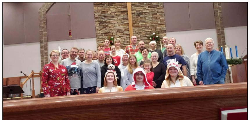
PJ Christmas Party Christmas Morning Service