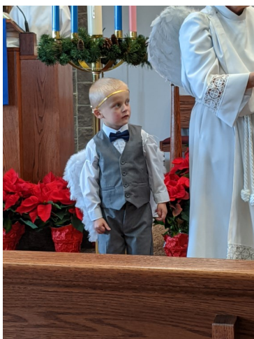
Christmas Program December 22, 2019

Some of the goals I believe we should set for 2020 are to legitimize the technology team as a very needed and valued ministry among us, to increase the number of people serving as Sound Techs or Projectionists, to schedule some training for all interested persons, and to create a service schedule like other worship assistants currently have. I am praying and working to these ends.