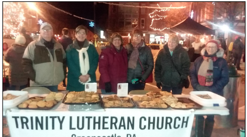
Trinity's helpers at Heritage Christmas